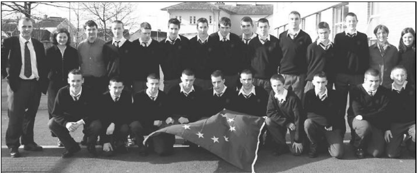
Last year's European Young Consumers Award winners (1st in Ireland and 1st in Europe) the Clonmel High School recently travelled to Strasbourg to represent Ireland at the opening of the European Parliament and to receive for their winning project entitled "A