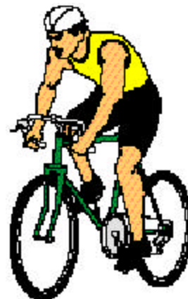
As well as attaining awards